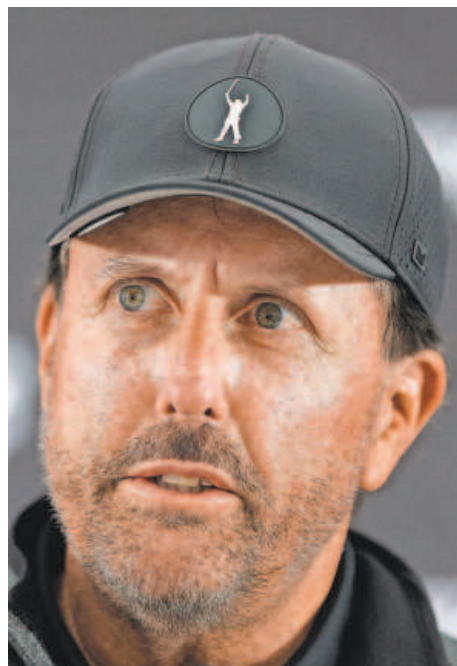
Phil Mickelson said Wednesday, “I choose not to speak publicly on PGA Tour issues at this time.”

“Just like the PGA Tour, the Ryder Cup has provided so many relation-