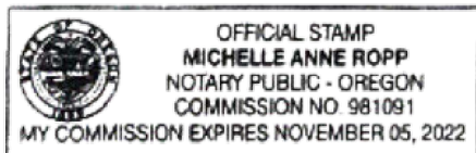
Notary Public-State of Oregon